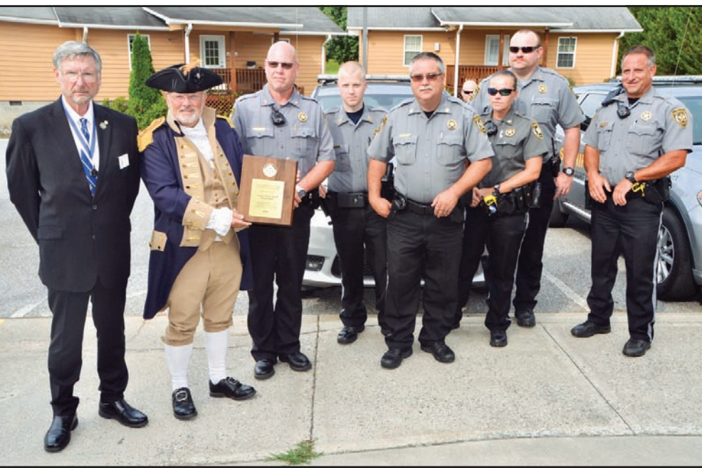
The Blue Ridge Mountains Chapter Sons of the American Revolution presented Union County Sheriff's Office deputies an appreciation award last week.